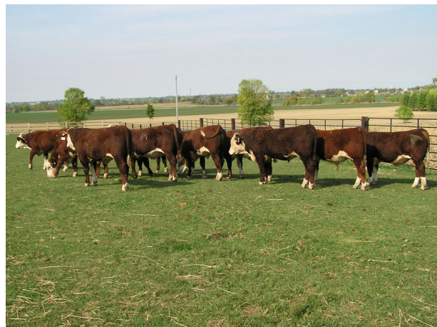
Hereford bulls at the Lindsay Quarantine Station