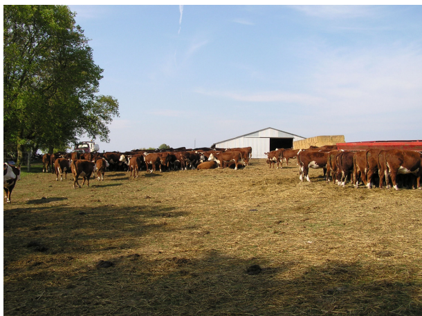
Hereford heifers at the Lindsay Quarantine Station