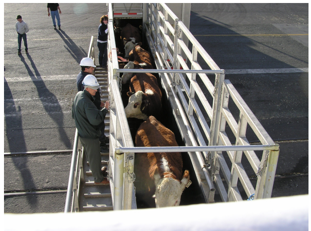
Herefords walking up the loading ramp to the ship