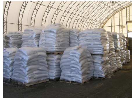
A glimpse of the rations

Consider, if you will, the exact quantity of bedding (shavings), hay and rations required for this number cattle, mainly bred yearling heifers. How about 140 tons of hay, 105 tons of bulk rations, and 100 ton of bagged ration. The constant whine of feed being blown into huge silos within the ship, the skipping back and forth of forklifts on the ground and on the ship, and the crane placing platform after platform of compressed hay bales wrapped in bundles of twenty, onto the top of the ship for the crew to maneuver into place to fill the top deck of the ship with supplies, makes one realize the many details that must come together in perfect precision.